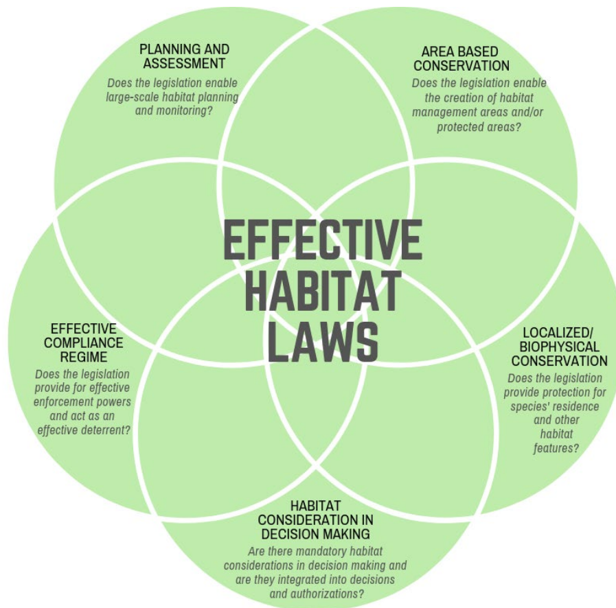
Figure 1: Core Components of Habitat Laws