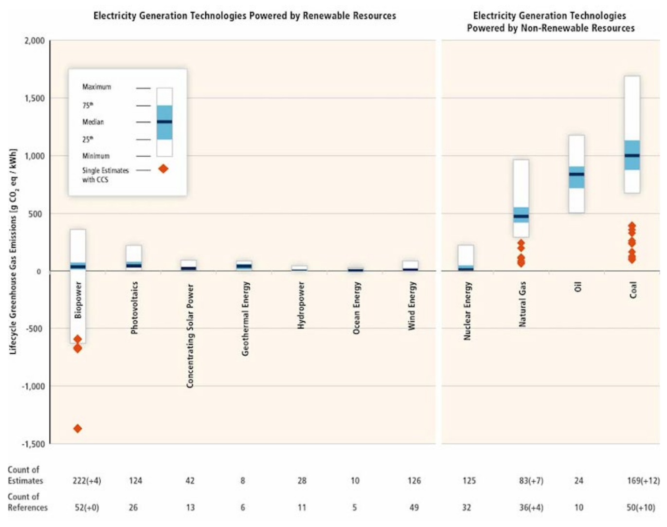
Figure 2: IPCC rendering of the GHG emissions released during the lifecycle of both renewable and non-renewable energy sources.

Image courtesy of the Intergovernmental Panel on Climate Change<sup>36</sup>