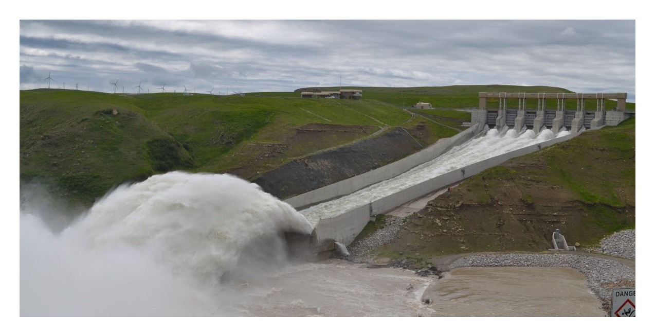
Oldman River Dam main spillway

Run-of-river projects, in contrast, are often applauded for having comparatively less effect on the surrounding ecosystems. This is in part because run-of-river projects do not require large flooded areas and do not dramatically transform river ecosystems. However, these projects also come with their own environmental risks. These risks include: effects on the water flow and temperature which can impact fish populations; increased access roads which fragment otherwise remote landscapes; and increased infrastructure which can lead to sedimentation in the river systems. Additionally, because run-of-river projects provide significantly less power output than dams, more of them would be needed to fill the gap left by decreased fossil fuel usage.